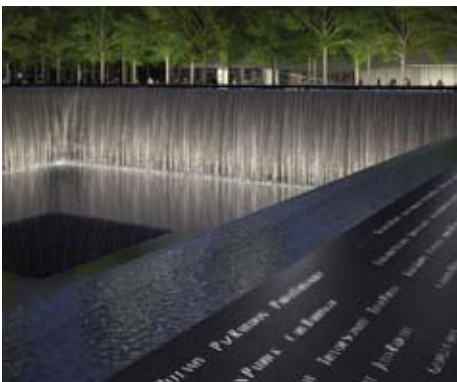
The Memorial names parapet at night. Rendering Squared Design Lab