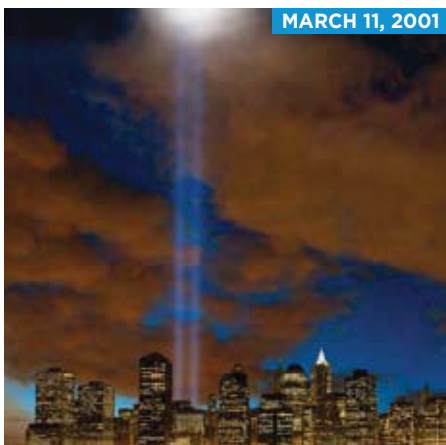
MARCH 11, 2001

SEPTEMBER 11, 2011: Dedication of the 9/11 Memorial.