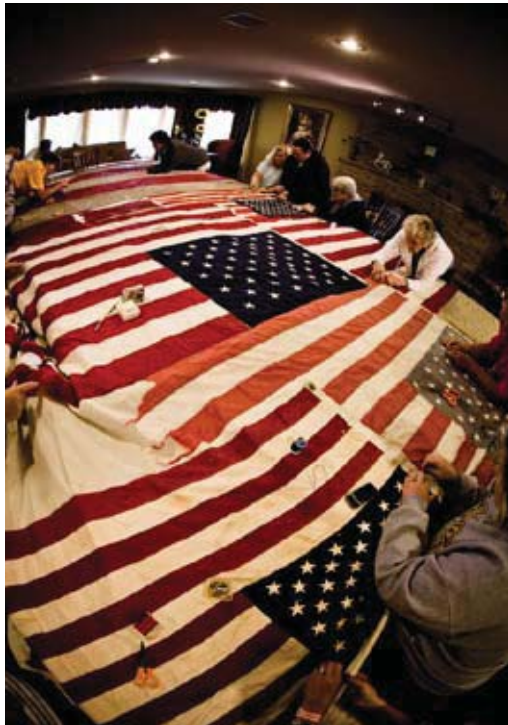
Promised gift to the 9/11 Memorial Museum.