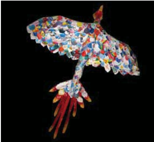
Feathers of the Phoenix.