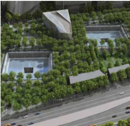
Aerial view of 9/11 Memorial. Rendering Squared Design Lab