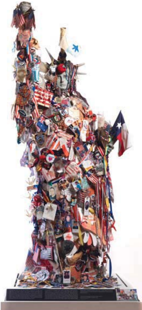
Gift in memory of the courageous firefighters from Engine 54/Ladder 4/Battalion 9 killed at the World Trade Center on September 11, 2001.