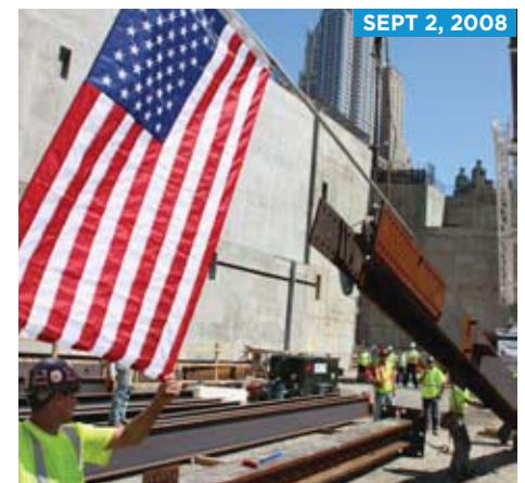
SEPT 2, 2008