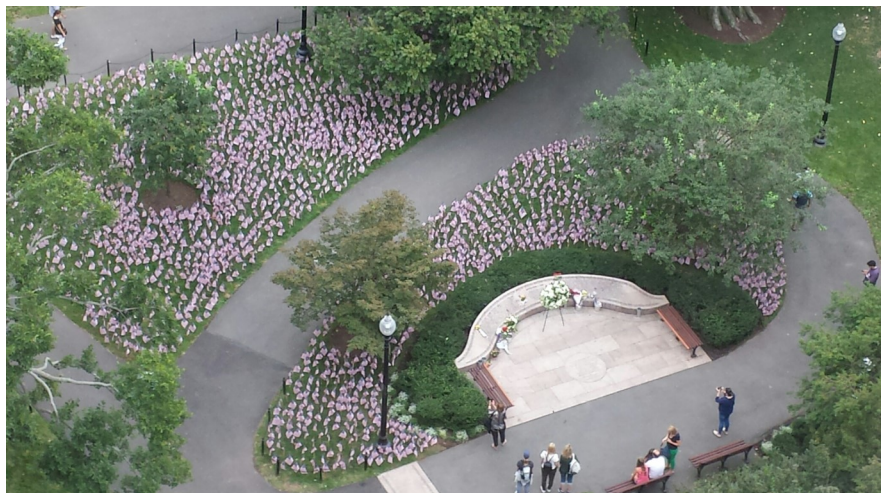
Aerial view of the 9/11 Memorial with planted flags at Boston Public Garden.

We are constantly updating our database to ensure Mass 9/11 Fund communication is reaching everyone. Please send any updates to your information to Alyse at alyse.mazerolle@massfund.org . If you feel you have not been receiving our electronic mail, please put info@massfund.org on your safe list to make sure your spam filter is not inadvertently rejecting mail from us. You always reserve the right to opt out of receiving communication from us.