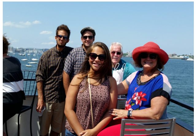
The Gay Family