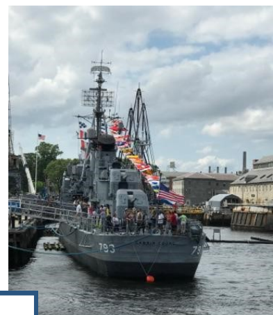
Tall Ships Harbor Cruise Sail Boston 2017