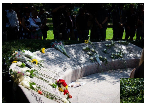
September 11th Memorial Boston Public Garden